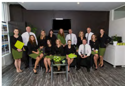
Living Here Launceston

My biggest challenge in Real Estate is trying to switch off. I feel a huge amount of responsibility to my clients, especially my owners, which can make it difficult at times to try and take a break.